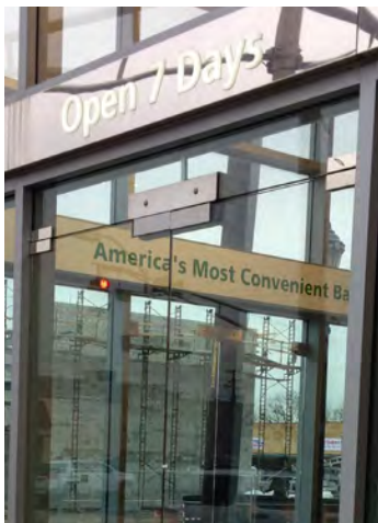
Herculite Magnet Mounting Assembly