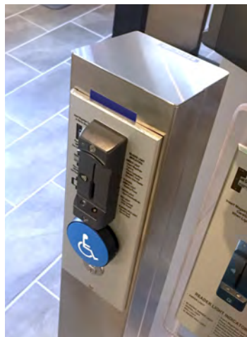
Stainless Steel, Floor Mounted Stanchion with MMR with Key Override Switch & Handicap Push Button