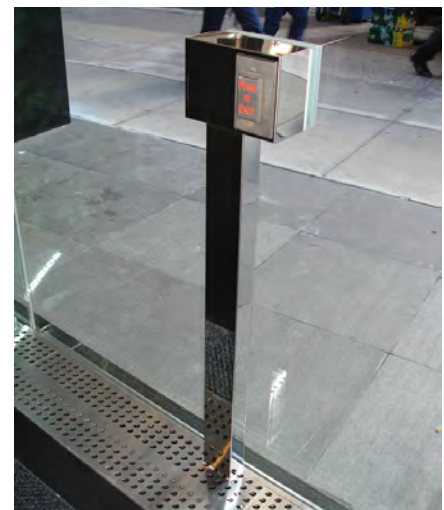
Thru the glass installation inside face