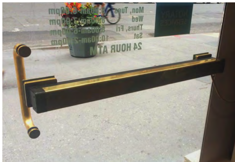
Brass, Glass Mounted Mechanical Touch Bar