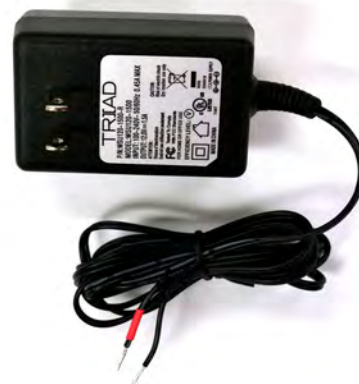
12 VDC Power Supply