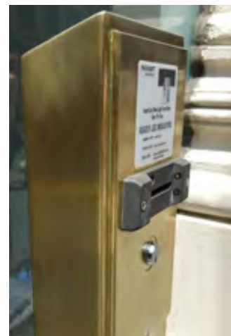
Brass, Glass Mounted Stanchion with SkimGuard™ Reader with Key Override Switch