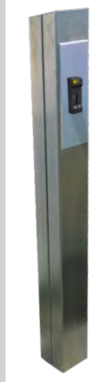
SkimGard™ Reader Posts