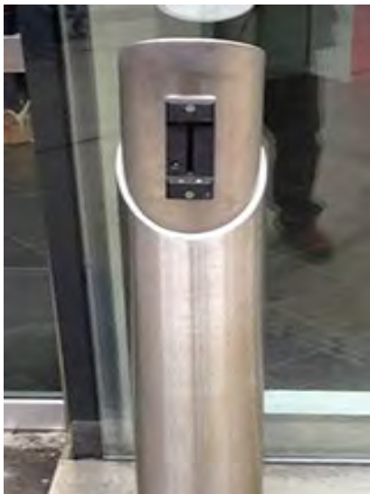
Stainless Steel, Weather-proof Stanchion with SkimGard™