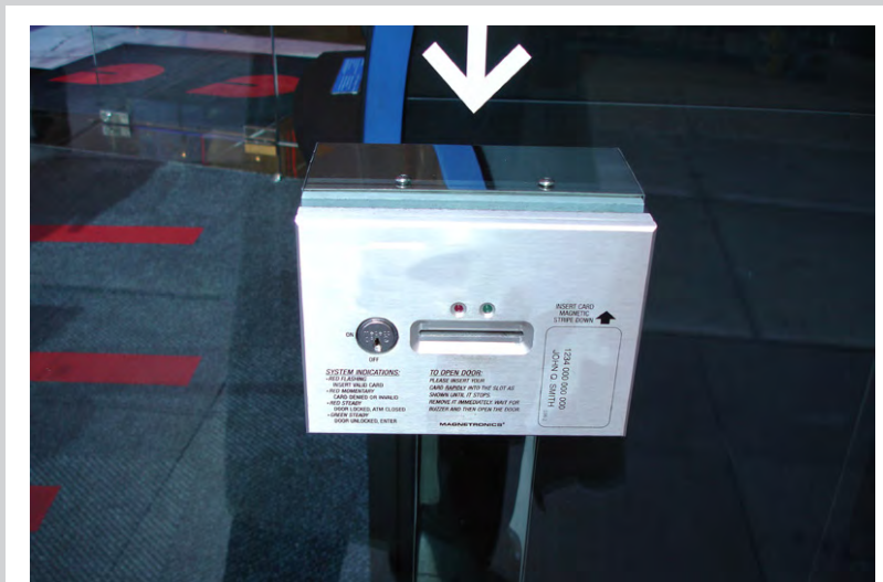
Thru the glass installation front face