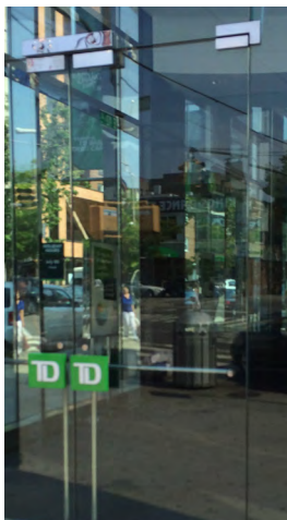
Tubular Push Bar Assembly